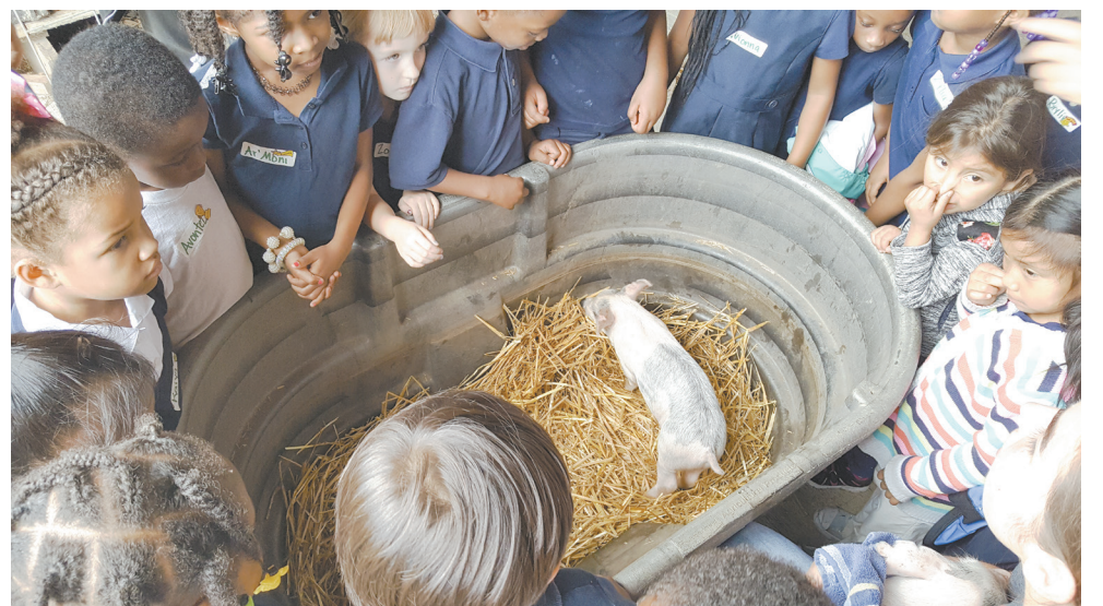
Kindergarten Students from Champaign Unit 4 schools enjoyed a day learning about agriculture and where their food comes from. The piglets were a big hit with the kids.