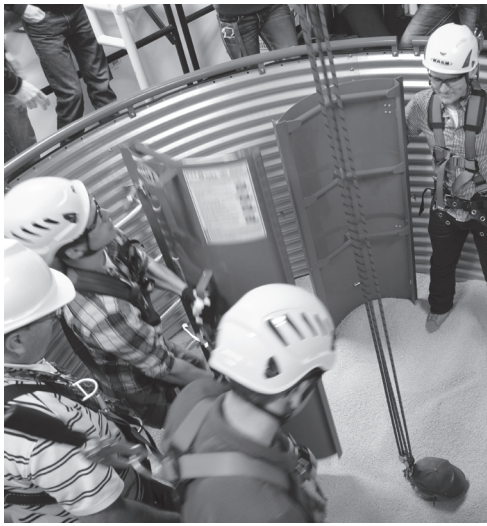
Great volunteers! Students were able to simulate a grain bin rescue using both a live person and a mannequin. Students used a grain tube to simulate the rescue, pounding down the panels and latching them together to create a chamber to put around the entrapped individual. Using a shop-vac, students cleared the grain in chamber to finish the rescue!