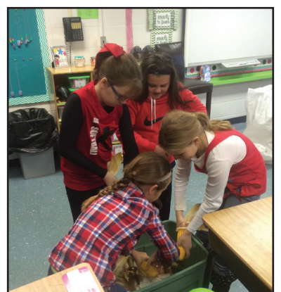
St. Joseph/Ogden students learning about corn!