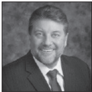
The crop insurance deadline is right around the corner. March 15, 2016! It is time for you to contact Matt Hoose, Illini FS Certified Crop Insurance Specialist. Not much has changed with crop insurance from last year. According to Matt, "Premiums are comparable to last year, but revenue guarantees don't look as good. The spring prices for revenue protection policy will be set in February."