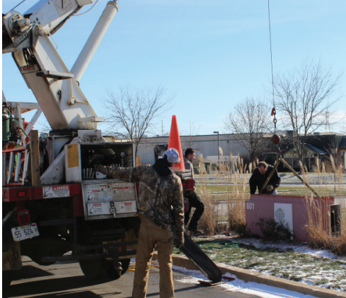
More Change! The old business sign is down and now in the process of raising the new one!